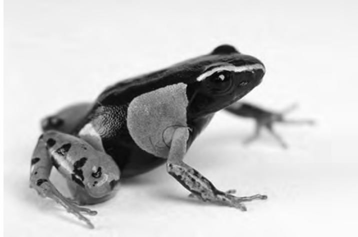
Magnification \times 2

Plan an investigation to compare the antibiotic properties of the secretions from two different species of Mantella frog.