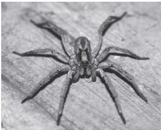
Magnification \times 1