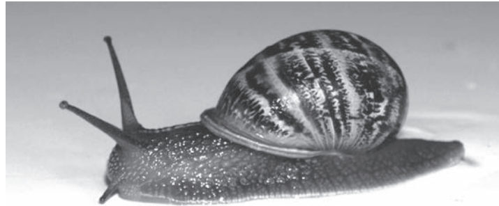
A Snail – Magnification \times 2

After repeated exposure to the same stimulus, the snail will stop responding to the stimulus. This behaviour is called habituation.