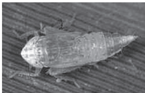
Magnification \times 10

Plan an investigation to determine the effectiveness of wolf spiders, bred in the laboratory, in the control of leafhopper nymphs in rice fields.