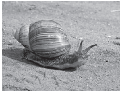
Giant African Land snail, Magnification x0.5

The student selected a snail (A) and placed it on a glass plate across which it was able to move. The student tapped the plate with a glass rod, next to the snail, causing the snail to stop moving and withdraw into its shell. The student recorded the time, in seconds, it took for the snail to re-emerge from its shell and start moving again.