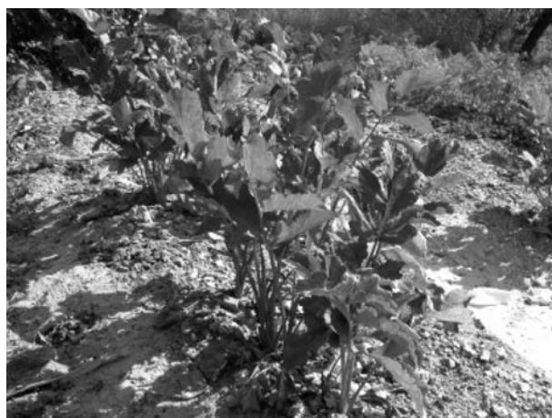
Magnification \times 0.2

If the seeds are sown too far apart, few will grow into adult plants and the crop will be poor. If they are sown too close together, few plants will emerge from the soil and the crop again is poor.