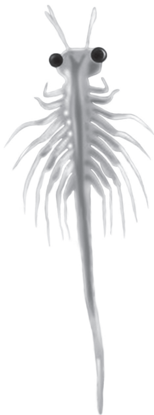
Magnification \times 10

3 The photograph below shows an adult brine shrimp.