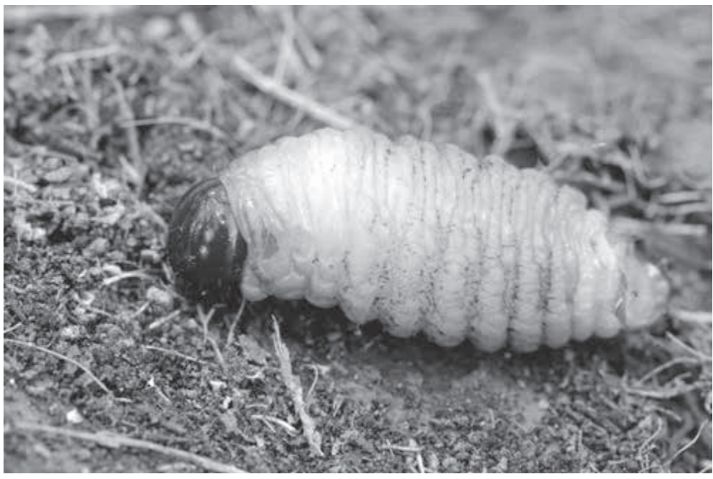
Magnification \times 10

The photograph below shows a larva of R. ferrugineus .